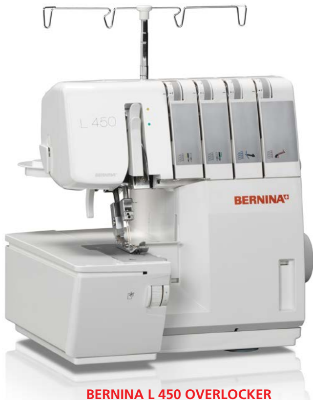
BERNINA L 450 OVERLOCKER

Just like your sewing machines, your overlocker needs regular cleaning and oiling. Unlike your sewing machine, knowing the proper time to do this may vary more from person to person. You will learn quickly that an overlocker/serger creates much more lint than a sewing machine because with every stitch it is also cutting the fabric. This eBook will give you tips for maintaining a trouble-free relationship with your overlocker.