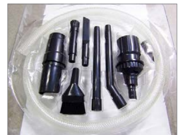
HELPFUL ADDITIONAL TOOLS