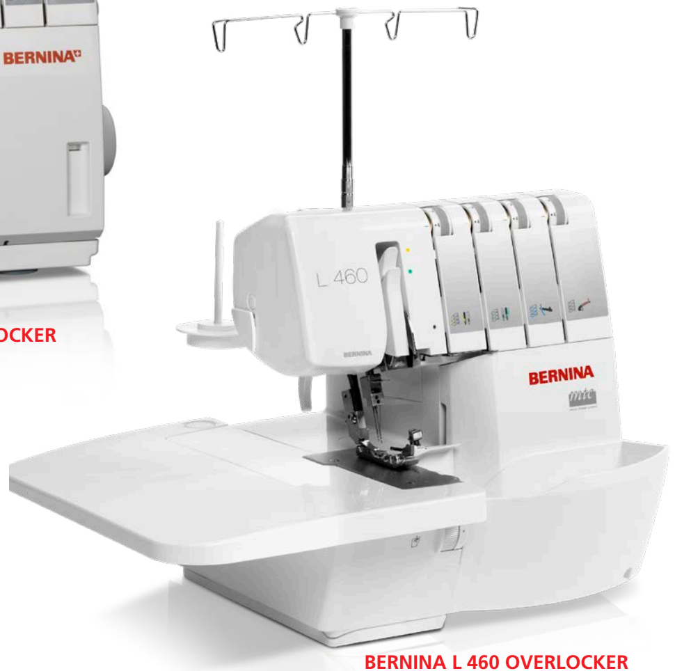
BERNINA L 460 OVERLOCKER