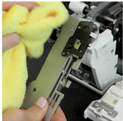
CLEANING THE BOTTOM OF THE STITCH PLATE

This is a good time to wipe down the stitch plate with a microfiber cloth. Then take the lint brush and maybe some cotton swabs to clean the feed dogs. When you have things all tidy, put everything back together.