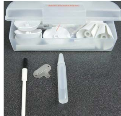
TOOLS THAT COME WITH THE MACHINE

Cotton swabs work well for capturing lint from hard to reach spaces, and the Micro Vacuum Attachment will literally suction up any lint from the machine.