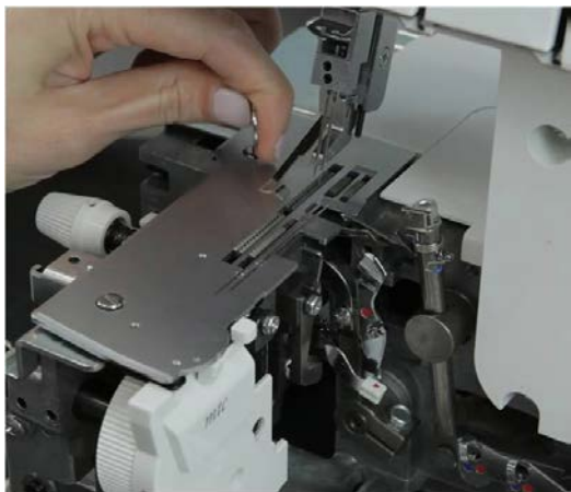
REMOVING THE STITCH PLATE

For this, begin by removing the stitch plate. This allows for better access to cleaning around the feed dogs of the machine. The machine will come with a screwdriver specifically for this purpose. There are two screws on the stitch plate. After the first time you remove them, they are simple to remove.