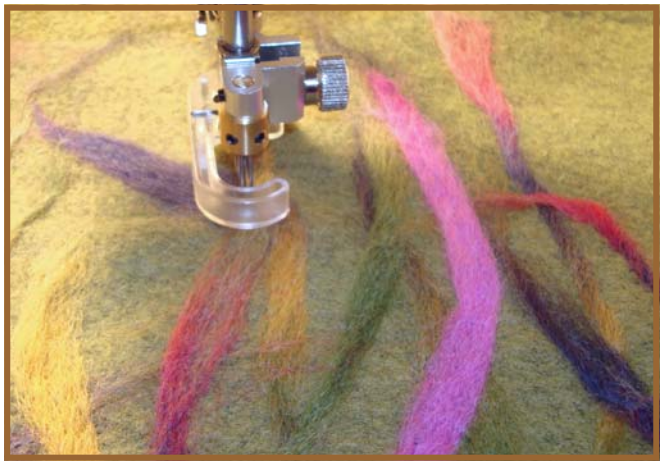
Punch into the surface of the fabric