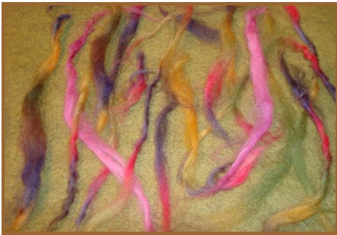
Arrange fibers as desired on base fabric

Place pieces of roving or yarn on the fabric, forming a random pattern. Don't over think this—just place the fiber on the fabric in a single layer. Once you have the roving and yarn in place, punch the fibers into the base fabric.