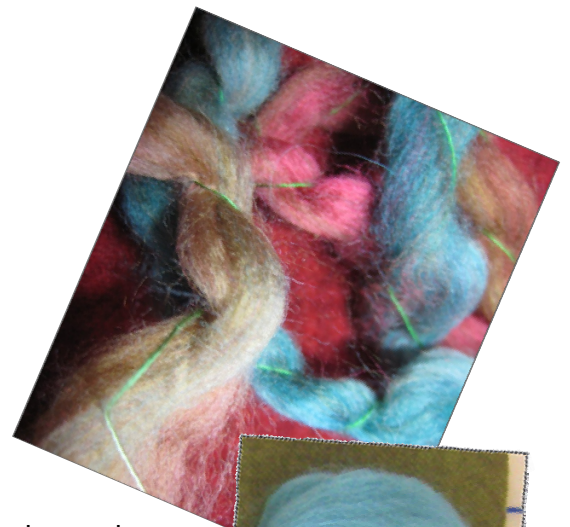
Roving and yarn are the most commonly punched fibers

After punching from the front, a punch from the back of the work, followed by a final punch from the front, will help to enmesh the fibers more securely into the fabric.