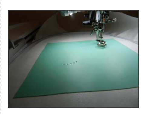
For detailed instructions for attaching and using the CrystalWork Tool, please refer to the Quick Start Guide provided with the accessory.

Synthetic suede or leather will be damaged if touched directly with a hot iron, so always be sure to use a silicon or cotton press cloth when heat setting or adding crystals.