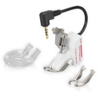
BERNINA Stitch Regulator #42