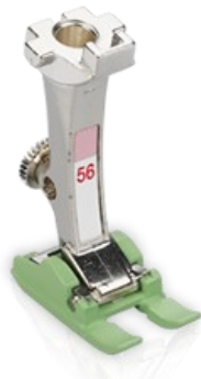
Non-Stick Open Embroidery Foot #56