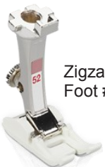
Zigzag Foot #52