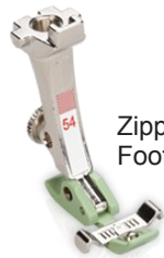
Zipper Foot #54

Visit bernina.com : Projects • Webinars • Promotions