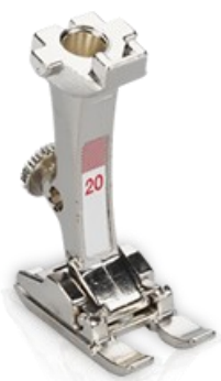
Open Embroidery Foot #20

Similar to Open Embroidery Foot #20, Foot #56 has an added coating on the sole to make it glide over fabrics that normally stick to metal presser feet such as plastic, vinyl and leathers.