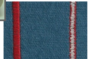
right side wrong side

The stitch length should be at the satin stitch setting (0.5mm stitch length) with a 2mm stitch width. The length can be adjusted slightly (shorter or longer) to get the desired look.